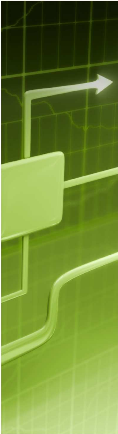
Figure 3. Equity market observations